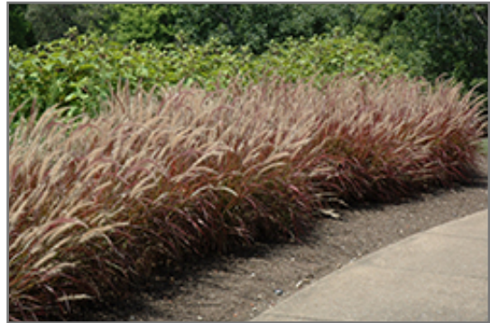
Purple Fountain Grass in bloom

Purple Fountain Grass will grow to be about 4 feet tall at maturity, with a spread of 3 feet. Although it's not a true annual, this plant can be expected to behave as an annual in our climate if left outdoors over the winter, usually needing replacement the following year. As such, gardeners should take into consideration that it will perform differently than it would in its native habitat.