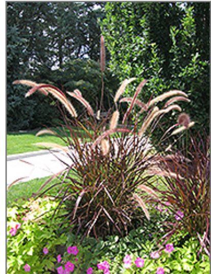
Purple Fountain Grass flowers

Purple Fountain Grass is recommended for the following landscape applications;