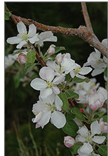
Pink Lady Apple flowers