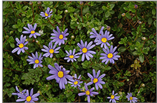
Blue Daisy flowers