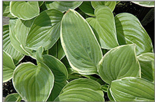
Frozen Margarita Hosta foliage

Frozen Margarita Hosta is recommended for the following landscape applications;