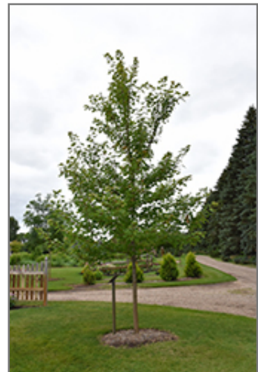
Matador Maple