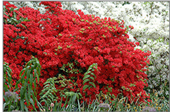
Stewartstonian Azalea in bloom