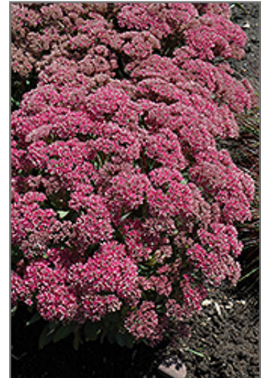
Mr. Goodbud Stonecrop flowers

Mr. Goodbud Stonecrop is recommended for the following landscape applications;