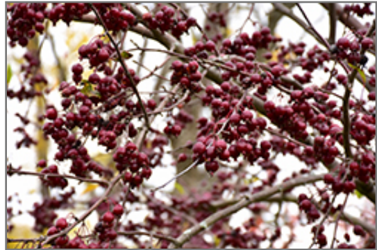
Purple Prince Flowering Crab fruit

This tree should only be grown in full sunlight. It prefers to grow in average to moist conditions, and shouldn't be allowed to dry out. It is not particular as to soil type or pH. It is highly tolerant of urban pollution and will even thrive in inner city environments. This particular variety is an interspecific hybrid.