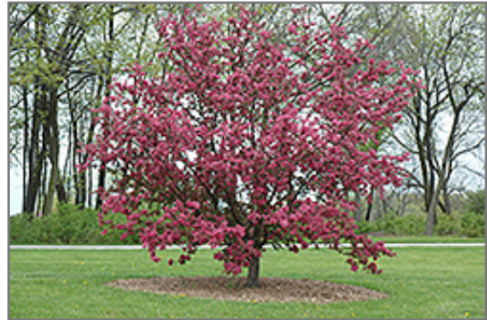
Purple Prince Flowering Crab in bloom

This tree will require occasional maintenance and upkeep, and is best pruned in late winter once the threat of extreme cold has passed. It is a good choice for attracting birds to your yard. It has no significant negative characteristics.