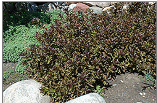
Dark Horse Weigela