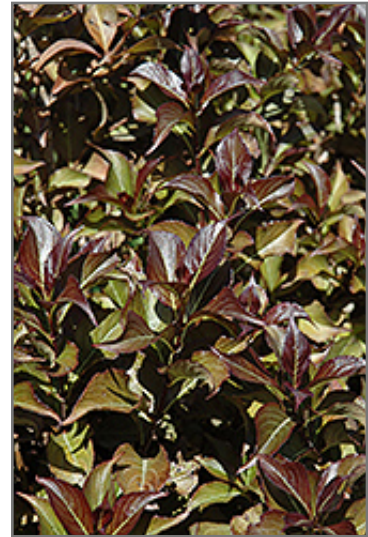
Dark Horse Weigela foliage

Dark Horse Weigela makes a fine choice for the outdoor landscape, but it is also well-suited for use in outdoor pots and containers. Because of its height, it is often used as a 'thriller' in the 'spiller-thriller-filler' container combination; plant it near the center of the pot, surrounded by smaller plants and those that spill over the edges. It is even sizeable enough that it can be grown alone in a suitable container. Note that when grown in a container, it may not perform exactly as indicated on the tag - this is to be expected. Also note that when growing plants in outdoor containers and baskets, they may require more frequent waterings than they would in the yard or garden.