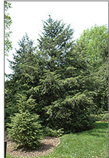
Canadian Hemlock