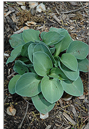
Blue Mouse Ears Hosta