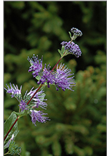
Blue Mist Caryopteris flowers

Blue Mist Caryopteris is recommended for the following landscape applications;