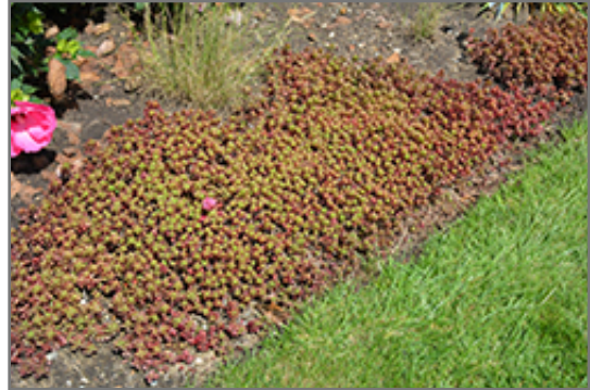
Fulda Glow Stonecrop

Fulda Glow Stonecrop is a fine choice for the garden, but it is also a good selection for planting in outdoor pots and containers. Because of its spreading habit of growth, it is ideally suited for use as a 'spiller' in the 'spiller-thriller-filler' container combination; plant it near the edges where it can spill gracefully over the pot. Note that when growing plants in outdoor containers and baskets, they may require more frequent waterings than they would in the yard or garden.