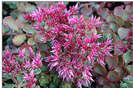
Fulda Glow Stonecrop flowers