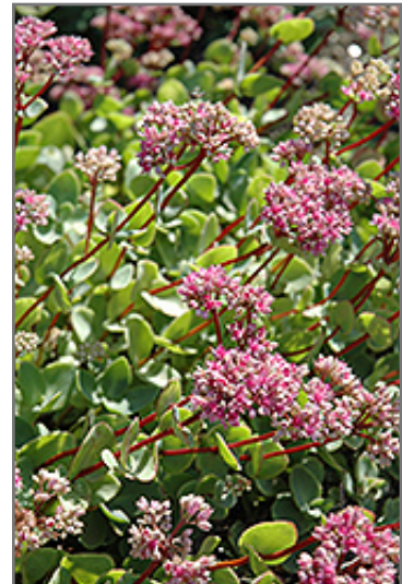
October Daphne flowers