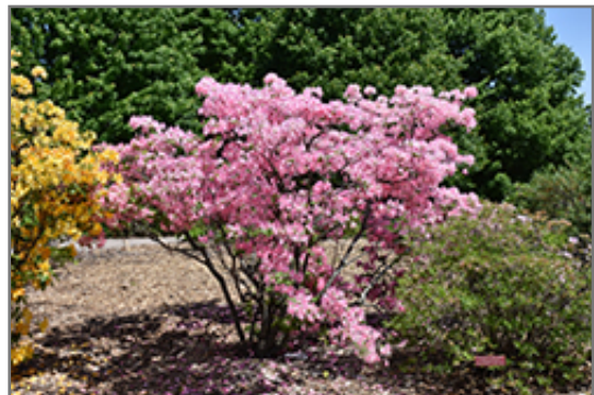
Northern Lights Azalea in bloom