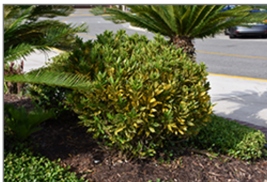
Gold Dust Variegated Croton