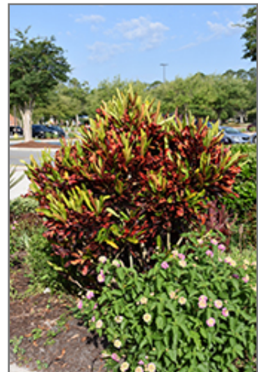
Mammy Croton