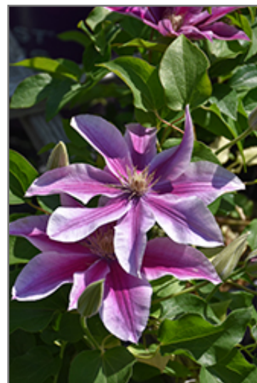
Boulevard Poseidon Clematis flowers