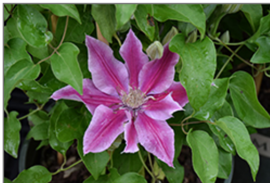
Boulevard Poseidon Clematis flowers

Boulevard Poseidon Clematis is recommended for the following landscape applications;