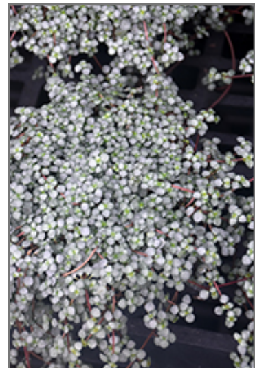
Aquamarine Pilea foliage