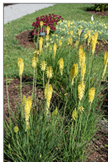
Glow Stick Torchlily in bloom