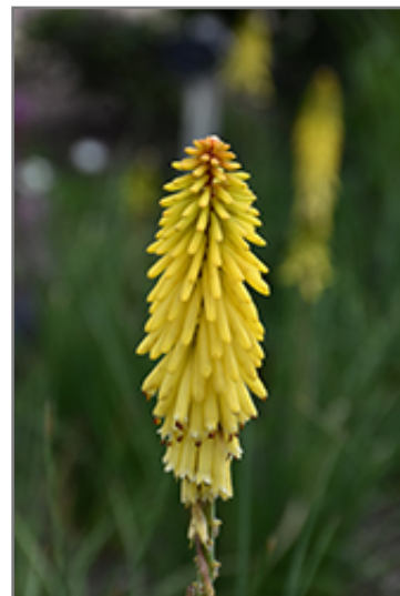
Glow Stick Torchlily flowers

Glow Stick Torchlily is recommended for the following landscape applications;