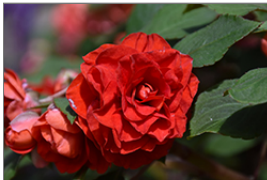
Glimmer Bright Red Double Impatiens flowers