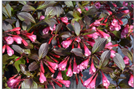
Very Fine Wine Weigela flowers