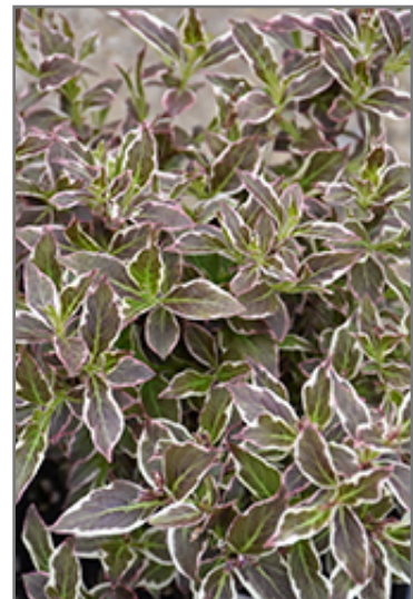
My Monet Purple Effect Weigela foliage