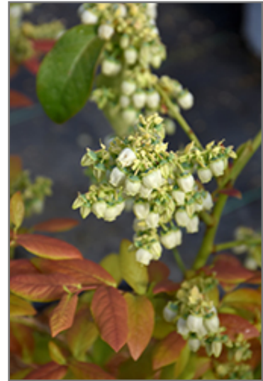
Sky Dew Gold Ornamental Blueberry flowers

Sky Dew Gold Ornamental Blueberry has attractive gold-variegated lime green foliage with hints of chartreuse which emerges brick red in spring on a plant with an upright spreading habit of growth. The glossy oval leaves are highly ornamental and turn outstanding shades of orange and scarlet in the fall. It features dainty clusters of white bell-shaped flowers hanging below the branches in mid spring. It features an abundance of magnificent blue berries in mid summer. The smooth brick red bark adds an interesting dimension to the landscape.