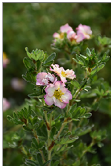
Happy Face Hearts Potentilla flowers