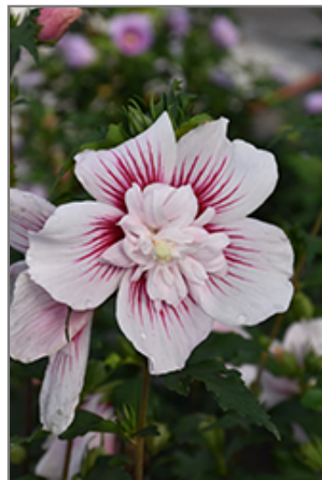
Starblast Chiffon Rose of Sharon flowers

Starblast Chiffon Rose of Sharon is recommended for the following landscape applications;