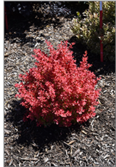
Sunjoy Neo Japanese Barberry

Sunjoy Neo Japanese Barberry makes a fine choice for the outdoor landscape, but it is also well-suited for use in outdoor pots and containers. It can be used either as 'filler' or as a 'thriller' in the 'spiller-thriller-filler' container combination, depending on the height and form of the other plants used in the container planting. It is even sizeable enough that it can be grown alone in a suitable container. Note that when grown in a container, it may not perform exactly as indicated on the tag - this is to be expected. Also note that when growing plants in outdoor containers and baskets, they may require more frequent waterings than they would in the yard or garden.