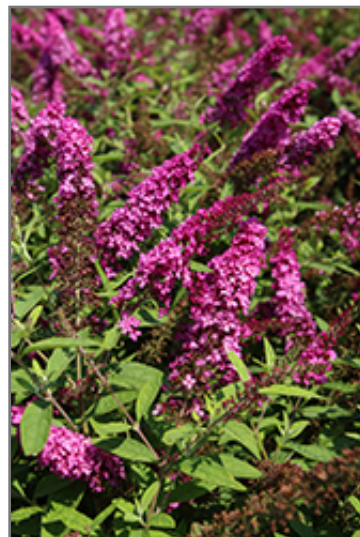
Lo & Behold Ruby Chip Butterfly Bush flowers

Lo & Behold Ruby Chip Butterfly Bush is a multi-stemmed deciduous shrub with a mounded form. Its average texture blends into the landscape, but can be balanced by one or two finer or coarser trees or shrubs for an effective composition.