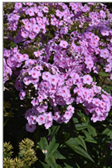
Luminary Opalescence Garden Phlox flowers

Luminary Opalescence Garden Phlox is recommended for the following landscape applications;