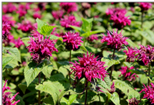
Bee-You Bee-True Beebalm flowers

Bee-You Bee-True Beebalm is recommended for the following landscape applications;