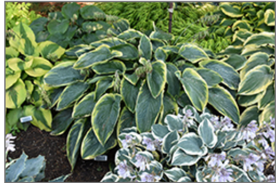
Shadowland Wu-La-La Hosta

This is a relatively low maintenance plant, and is best cleaned up in early spring before it resumes active growth for the season. Gardeners should be aware of the following characteristic(s) that may warrant special consideration;