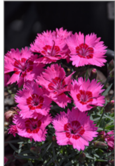
Paint The Town Fancy Pinks flowers

Paint The Town Fancy Pinks is a fine choice for the garden, but it is also a good selection for planting in outdoor pots and containers. It is often used as a 'filler' in the 'spiller-thriller-filler' container combination, providing a mass of flowers and foliage against which the thriller plants stand out. Note that when growing plants in outdoor containers and baskets, they may require more frequent waterings than they would in the yard or garden.