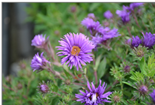
Grape Crush New England Aster flowers