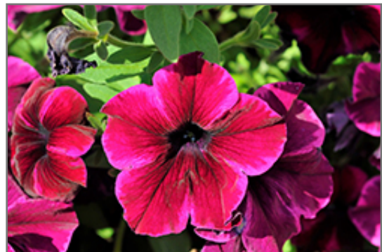
Crazytunia Cosmic Purple Petunia flowers