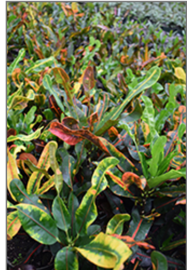
Mammy Croton in full

This is a dense herbaceous evergreen houseplant with an upright spreading habit of growth. Its wonderfully bold, coarse texture is quite ornamental and should be used to full effect. This plant should not require much pruning, except when necessary to keep it looking its best.