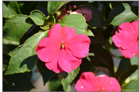
Beacon Rose Impatiens flowers

Beacon Rose Impatiens will grow to be about 15 inches tall at maturity, with a spread of 12 inches. When grown in masses or used as a bedding plant, individual plants should be spaced approximately 8 inches apart. Its foliage tends to remain dense right to the ground, not requiring facer plants in front. This fast-growing annual will normally live for one full growing season, needing replacement the following year.