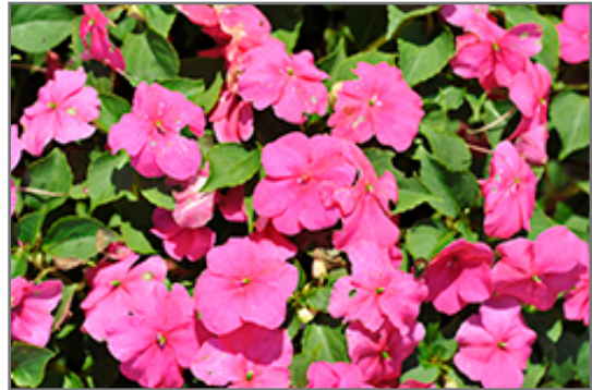
Beacon Rose Impatiens flowers

Beacon Rose Impatiens is recommended for the following landscape applications;