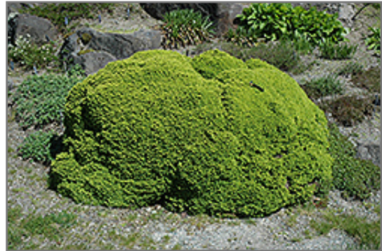
Little Gem Spruce