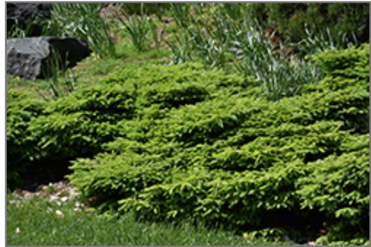
Little Gem Spruce

This shrub does best in full sun to partial shade. It does best in average to evenly moist conditions, but will not tolerate standing water. It is not particular as to soil type or pH, and is able to handle environmental salt. It is highly tolerant of urban pollution and will even thrive in inner city environments. This is a selected variety of a species not originally from North America.