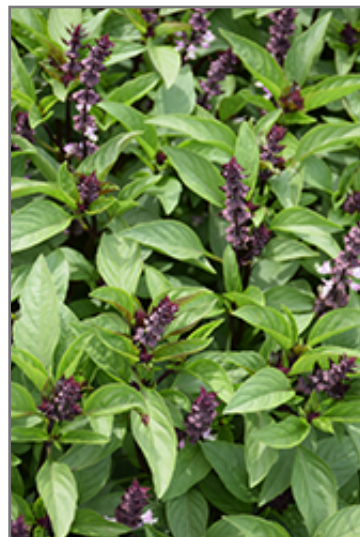
Sweet Basil flowers

Sweet Basil is a good choice for the edible garden, but it is also well-suited for use in outdoor pots and containers. It is often used as a 'filler' in the 'spiller-thriller-filler' container combination, providing the canvas against which the larger thriller plants stand out. Note that when growing plants in outdoor containers and baskets, they may require more frequent waterings than they would in the yard or garden.