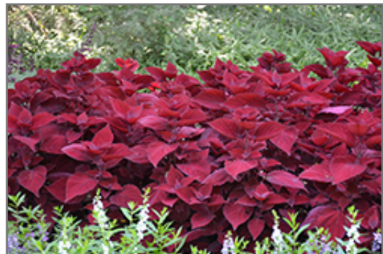
Beale Street Coleus