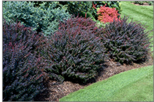
Sunjoy Mini Maroon Japanese Barberry

Sunjoy Mini Maroon Japanese Barberry is recommended for the following landscape applications;