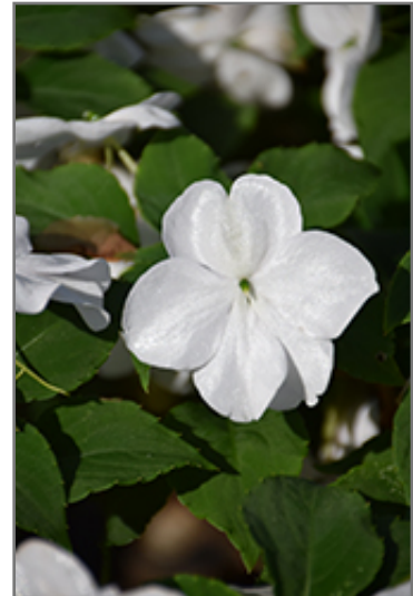
Beacon White Impatiens flowers

Beacon White Impatiens is recommended for the following landscape applications;