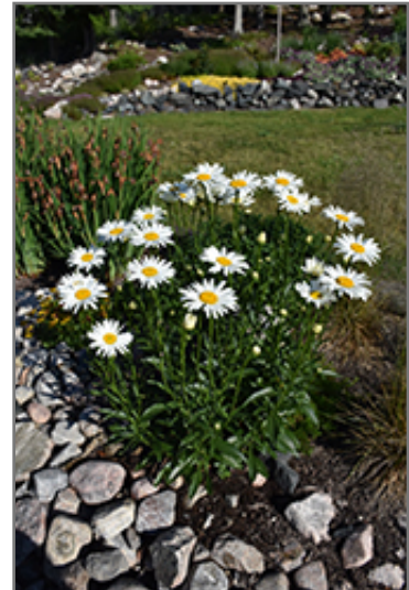
Becky Shasta Daisy in bloom

Becky Shasta Daisy is a fine choice for the garden, but it is also a good selection for planting in outdoor pots and containers. Because of its height, it is often used as a 'thriller' in the 'spiller-thriller-filler' container combination; plant it near the center of the pot, surrounded by smaller plants and those that spill over the edges. It is even sizeable enough that it can be grown alone in a suitable container. Note that when growing plants in outdoor containers and baskets, they may require more frequent waterings than they would in the yard or garden.