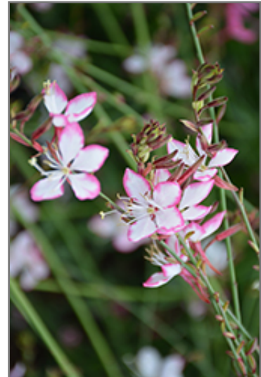
Rosy Jane Gaura flowers

Rosy Jane Gaura is recommended for the following landscape applications;