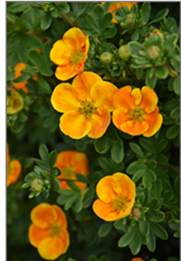
Mandarin Tango Potentilla flowers