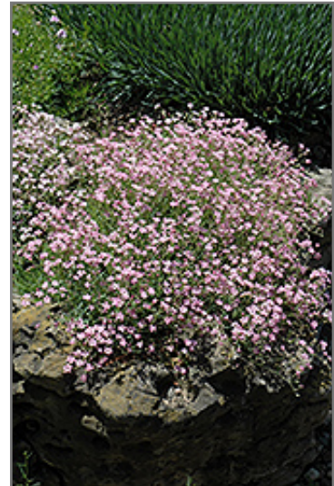
Pink Creeping Baby's Breath in bloom