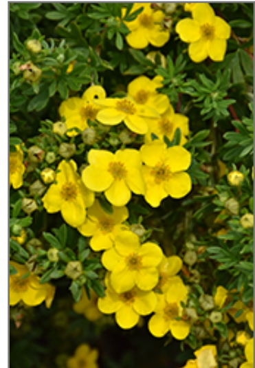
Happy Face Yellow Potentilla flowers