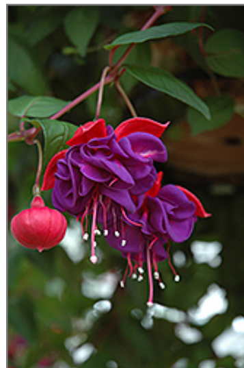
Blue Eyes Fuchsia flowers

When grown indoors, Blue Eyes Fuchsia can be expected to grow to be about 12 inches tall at maturity, with a spread of 24 inches. It grows at a fast rate, and under ideal conditions can be expected to live for approximately 8 years. This houseplant will do well in a location that gets either direct or indirect sunlight, although it will usually require a more brightly-lit environment than what artificial indoor lighting alone can provide. It does best in average to evenly moist soil, but will not tolerate standing water. The surface of the soil shouldn't be allowed to dry out completely, and so you should expect to water this plant once and possibly even twice each week. Be aware that your particular watering schedule may vary depending on its location in the room, the pot size, plant size and other conditions; if in doubt, ask one of our experts in the store for advice. It is not particular as to soil type or pH; an average potting soil should work just fine.