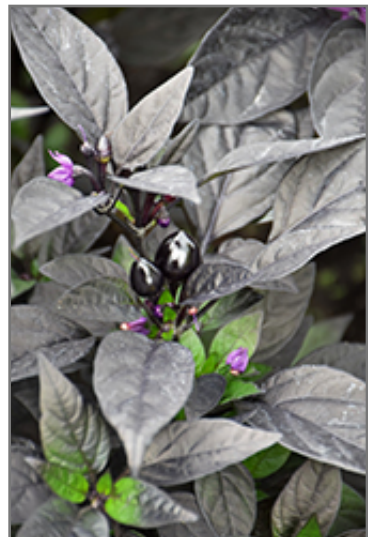
Black Pearl Ornamental Pepper fruit