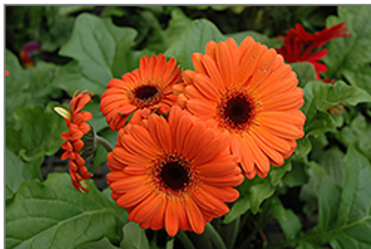
Orange Gerbera Daisy flowers

When grown indoors, Orange Gerbera Daisy can be expected to grow to be about 12 inches tall at maturity extending to 16 inches tall with the flowers, with a spread of 12 inches. It grows at a fast rate, and under ideal conditions can be expected to live for approximately 3 years. This houseplant will do well in a location that gets either direct or indirect sunlight, although it will usually require a more brightly-lit environment than what artificial indoor lighting alone can provide. It does best in average to evenly moist soil, but will not tolerate standing water. The surface of the soil shouldn't be allowed to dry out completely, and so you should expect to water this plant once and possibly even twice each week. Be aware that your particular watering schedule may vary depending on its location in the room, the pot size, plant size and other conditions; if in doubt, ask one of our experts in the store for advice. It is not particular as to soil type or pH; an average potting soil should work just fine.