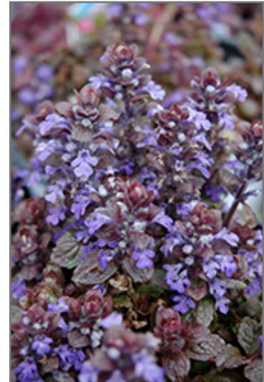
Bronze Beauty Bugleweed flowers

Bronze Beauty Bugleweed is recommended for the following landscape applications;